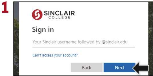
1 Visit my.sinclair.edu and log in using your Sinclair credentials.