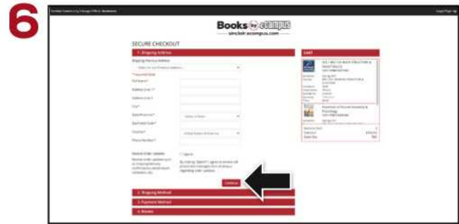
6 Begin the checkout process by entering your shipping address, or choosing Ship to Campus . Select Continue to choose your shipping method. Select your method on the payment screen: credit/debit card, financial aid, or PayPal. Select Continue to review. If a rental is selected, a credit card is required for collateral and will not be charged unless the book is returned damaged, or not returned. On the next page, select Place Order to receive your confirmation.