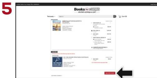
5 Courses you're enrolled in will automatically populate. Choose your purchasing options and select Add Item to Cart . On the next page, review your order and select Proceed to Checkout .