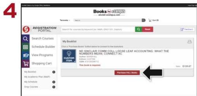
4 Click Purchase Fall Books.